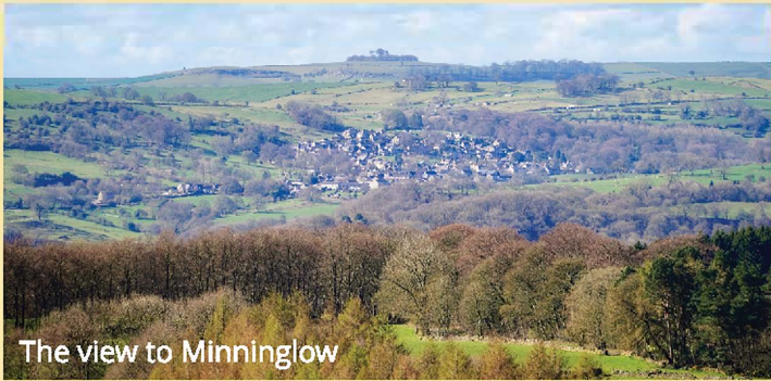
The view to Minninglow

See if you can spot a group of wind turbines on the horizon. They're 11 miles away at Carsington Pasture. A little further along to the right you might also see a distinctive ring of low trees with some taller trees in the centre. This is Minninglow, a Stone Age burial tomb that dates back to 3000BC! It's about 8 miles away.